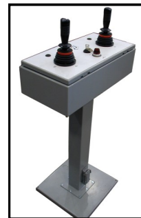
Dual Joystick Control