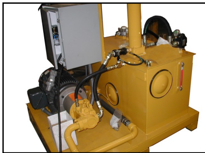
Free Standing Hydraulic Power