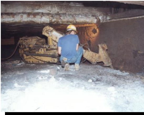
KT-10 Machine effectively working in low clearance height environment