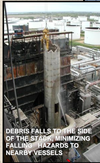
DEBRIS FALLS TO THE SIDE OF THE STACK, MINIMIZING FALLING HAZARDS TO NEARBY VESSELS

The Stack Crusher Unit can cut through reinforced concrete and brick stacks of various heights and diameters.