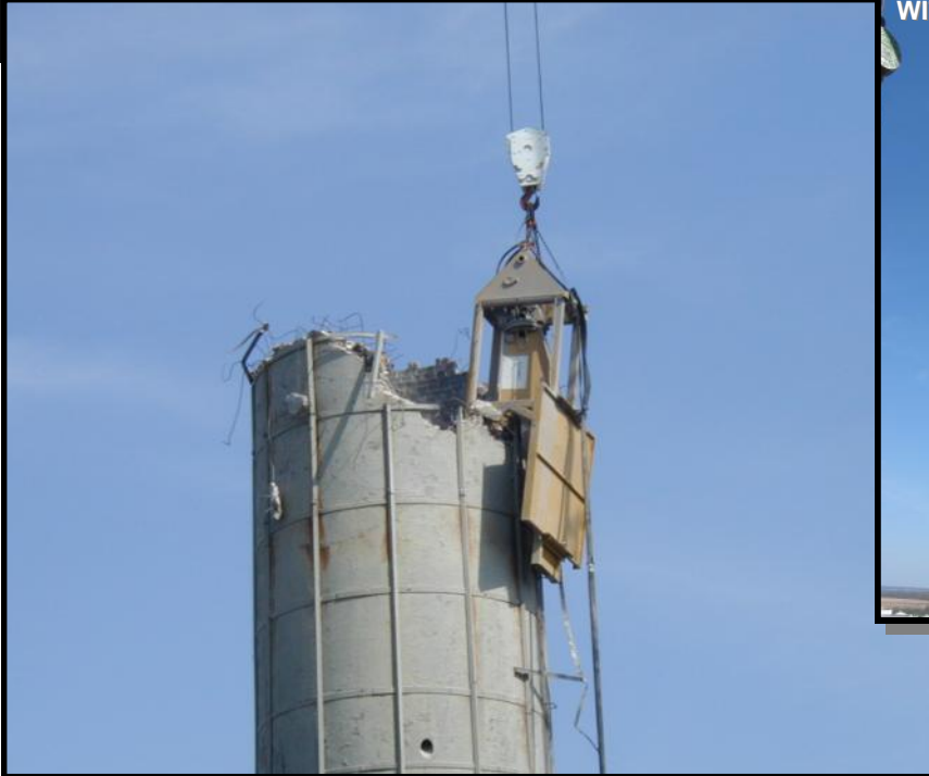
CRUSHER UNIT BEING LIFTED WITH CRANE TO STACK TOP