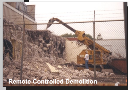
Remote Controlled Demolition