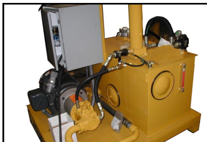
Free Standing Hydraulic Power