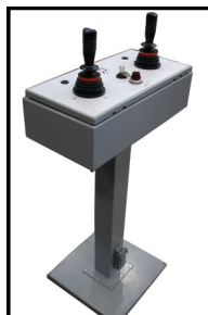
Dual Joystick Control