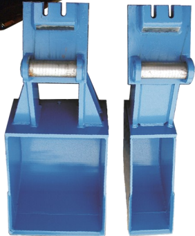
BOLTED FLAPPER BUCKETS